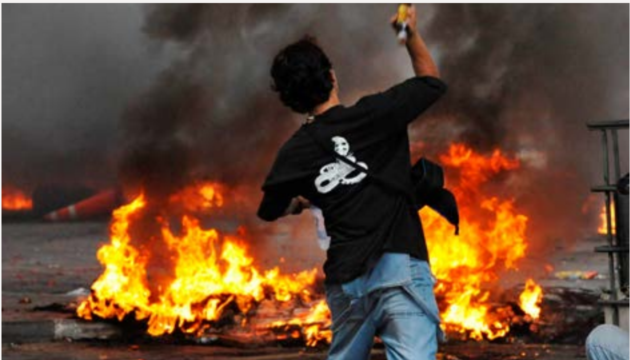
An anti-government protester throws a firebomb at Thai troops in central Bangkok on 16 May 2010, as clashes between Thai troops and the protesters intensify.

The potential dangers of a prolonged economic trough are global, but in East Asia many governments depend on their ability to deliver economic growth either to fulfil election promises, in the case of the democracies, or to justify their continued monopoly on power, in the case of the autocracies.